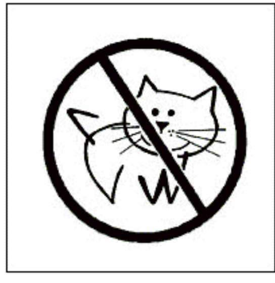
Also: no felines were harmed during the making of this Bordeaux.