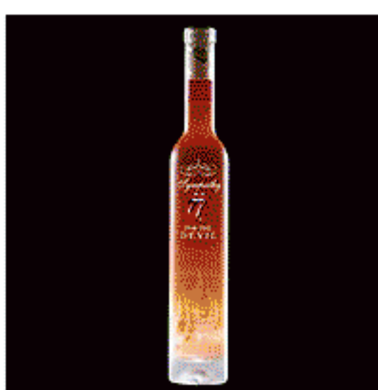
No "Brown Sugar" added.